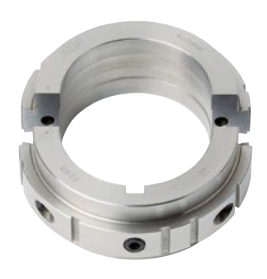
Mounting ring split